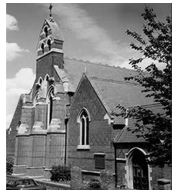
Holy Saviour Church, Radcliffe Road