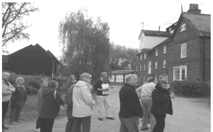
Left: Members viewing the archives at The Friends House Library and Archive in London. Right: Members outside Purwell Mill on the 'Purwell Perambulation' walk