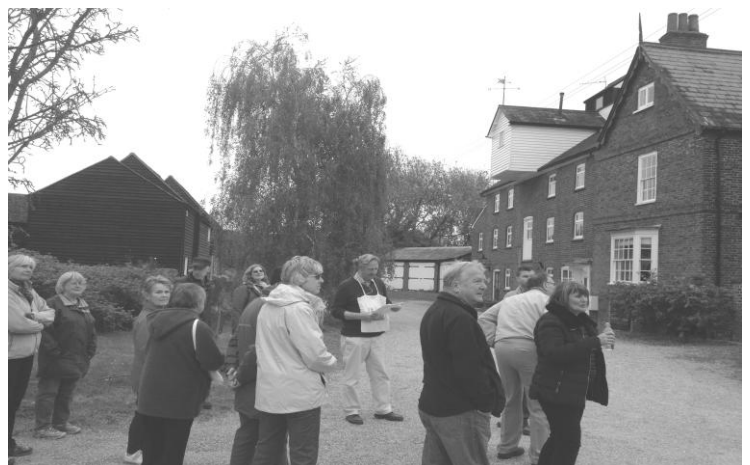
Left: Members viewing the archives at The Friends House Library and Archive in London. Right: Members outside Purwell Mill on the 'Purwell Perambulation' walk